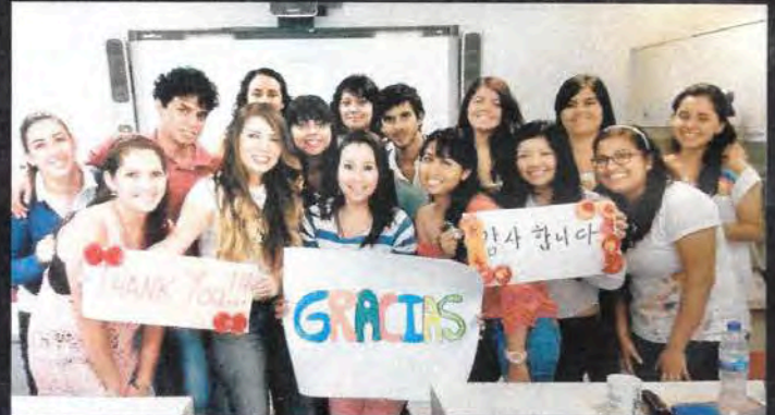
e-School participants from University of Colima, Mexico